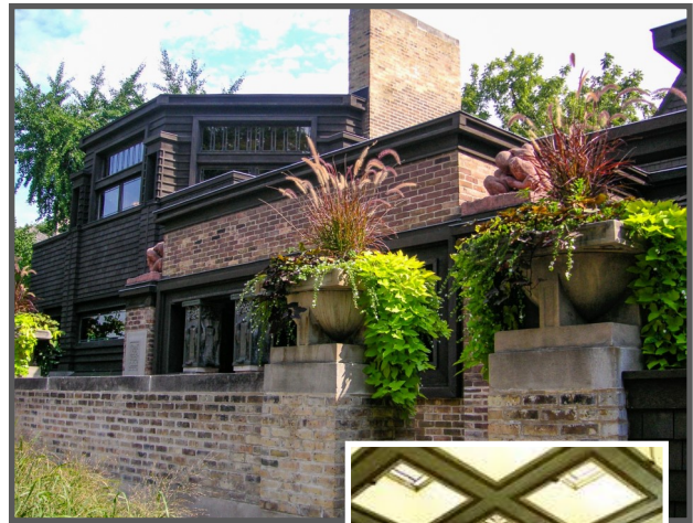
Clockwise from top right: Architecture tour from the Chicago River; Frank Lloyd Wright studio and Unity Temple; American Gothic at the Art Institute of Chicago; and Cloud Gate or "the Bean" at Millennium Park.